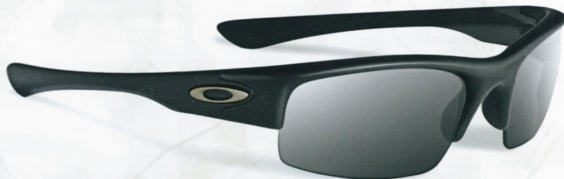
11-121 SI Bottlecap/Black/Grey

HIGH DEFINITION OPTICS® (HDO®) combines patented optics and PLUTONITE® lens material that provides 100% UV filtering and unsurpassed impact protection. An open-edge design of lightweight O MATTER® frame material, BOTTLECAP offers an unobstructed field of downward view. Offering a comfortable fit on all facial sizes, BOTTLECAP is especially well suited for small to medium-size faces, due to contouring that eliminates the wide corners of conventional frames. This durable optical instrument also provides 100% UV filtering and impact protection that meets all ANSI Z87.1 standards.