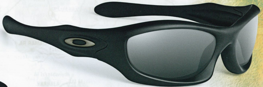
05-015 SI Monster Dog/Black/Grey

HIGH DEFINITION OPTICS® (HDO®) combines patented optics and PLUTONITE® lens material that provides 100% UV filtering and unsurpassed impact protection. Durable O MATTER® frame material forms massive fangs around the skull, combining with pure PLUTONITE® lenses to beat ANSI Industrial Standards for impact protection. O Matter frame material not only meets the demands of the field, it exceeds the durability requirements of industrial applications that include chemical exposure and environmental extremes. The lenses wrap around the head to maximize peripheral vision and protection. Patented HIGH DEFINITION OPTICS® (HDO®) maximizes peripheral vision while retaining critical clarity at all angles of view.