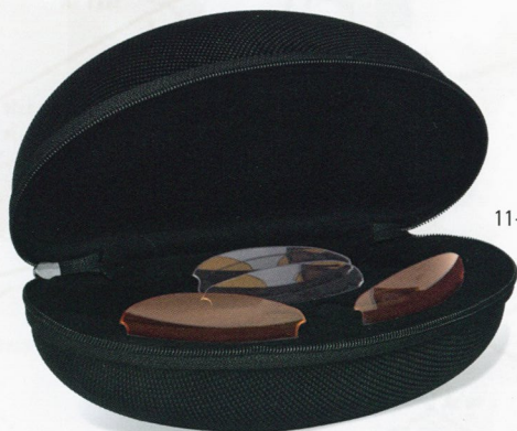
11-090 SI Half Jacket Array