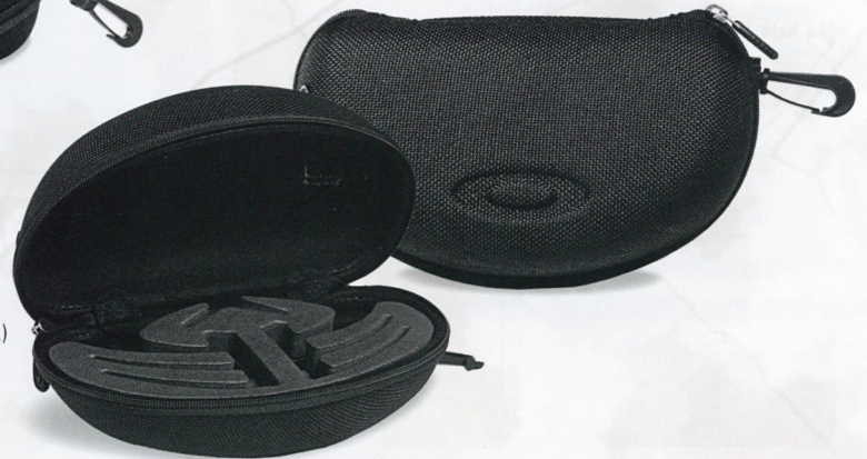
11-160 Ballistic M-Frame Array Case (Made in the USA)