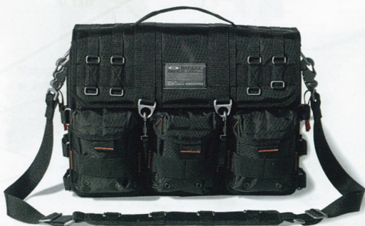
92042 SI Computer Bag

The sonically welded logo on the front and back puts this cap in the ranks of performance and style. It's a polyester stretch-fit design with mesh and eyelet venting to help keep you cool. The moisture-wicking sweatband is custom Oakley engineering, and for additional moisture transport, we gave this cap mesh lining.