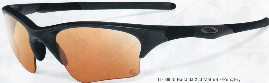
11-008 SI HalfJckt XLJ MatteBlk/Pers/Gry