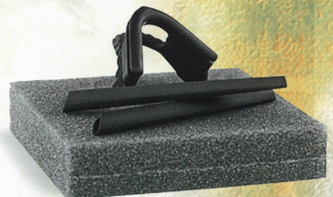
06-699 Ballistic M-Frame nose piece and earsock kit