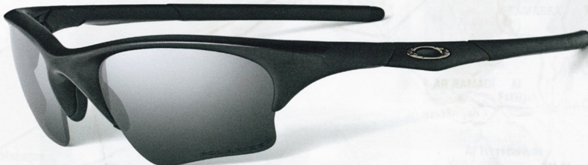
11-101 SI Half Jacket XLJ/Black/Grey Polarized