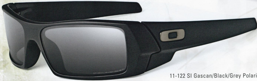
11-122 SI Gascan/Black/Grey Polarized

USSTANDARDISSUE.COM | 14 AVAILABLE WITH OAKLEY AUTHENTIC PRESCRIPTION LENSES.