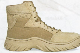
11094-889A SI Temperate Weather Assault Boot 6"