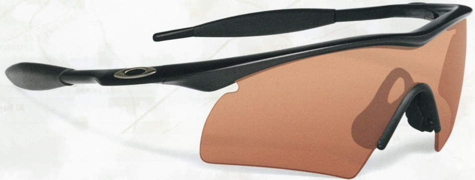
11-056 SI M Frame Hybrid/Black/VR28