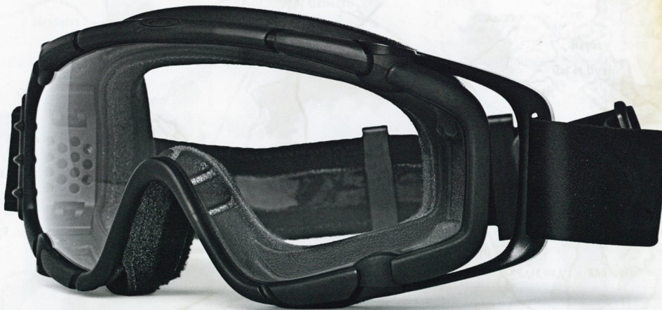
11-174 SI Ballistic Fan Goggle/Black/Clear