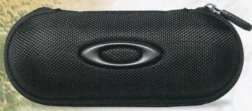
07-016 Small Soft Vault