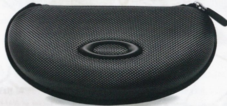
07-348 Half/Flak Soft Vault