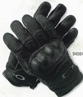
94084 SI Tactical FR Glove