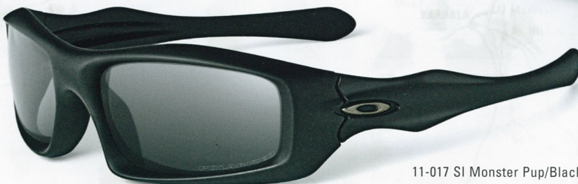
11-017 SI Monster Pup/Black/Grey Polarized

AVAILABLE WITH OAKLEY AUTHENTIC PRESCRIPTION LENSES. USSTANDARDISSUE.COM | 15