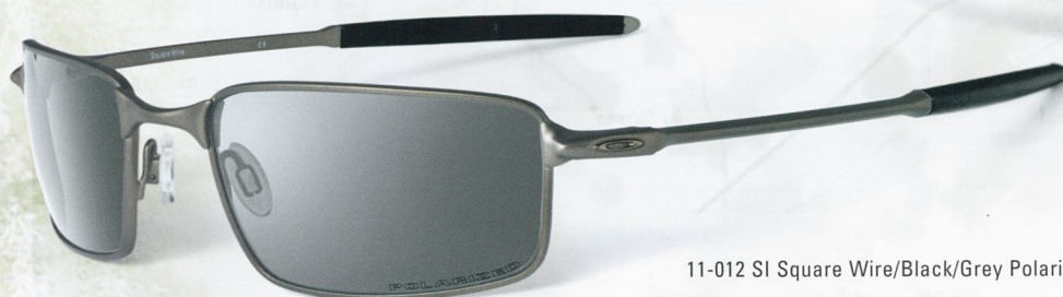
11-012 SI Square Wire/Black/Grey Polarized

USSTANDARDISSUE.COM | 18 AVAILABLE WITH OAKLEY AUTHENTIC PRESCRIPTION LENSES.