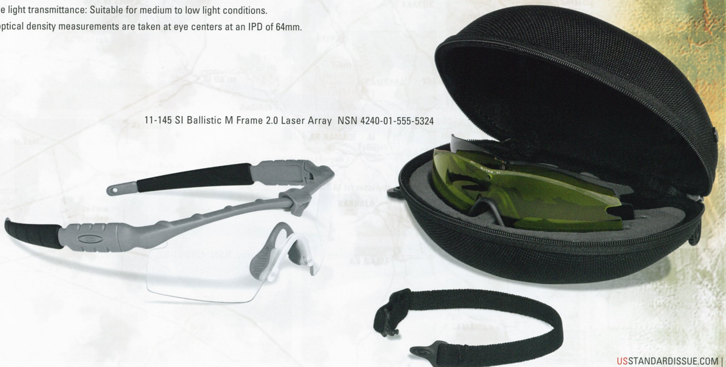
11-145 SI Ballistic M Frame 2.0 Laser Array NSN 4240-01-555-5324