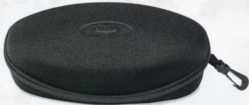
11-152 Ballistic Goggle Array Case (Made in the USA)