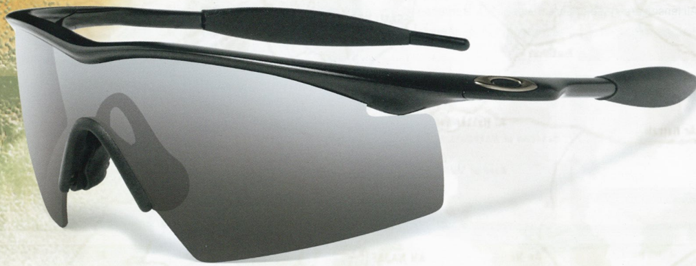
11-162 Industrial M Frame Black/Grey