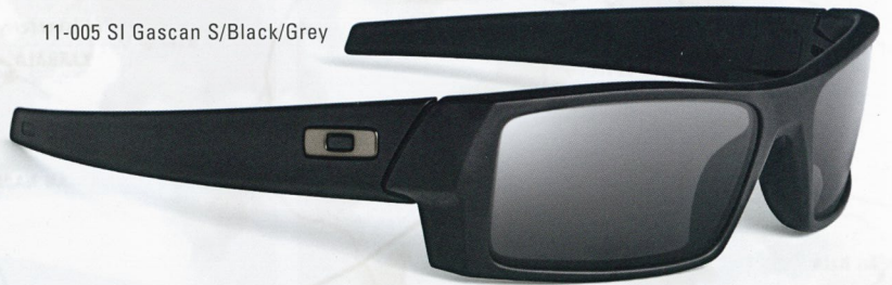
11-005 SI Gascan S/Black/Grey

HIGH DEFINITION OPTICS® (HDO®) combines patented optics and PLUTONITE® lens material that provides 100% UV filtering and unsurpassed impact protection. Two lenses are cut from the curve of a single lens shield, then mounted in the frame to maintain the original, continuous contour. Lightweight O MATTER® frame material offers premium comfort. Peripheral vision is maximized by HIGH DEFINITION OPTICS® (HDO®), an innovation that maintains visual clarity at all angles of view. Impact protection meets ANSI Z87.1 standards, and our Three-Point Fit retains the lenses in precise optical alignment. True metal icons sign this Oakley original.