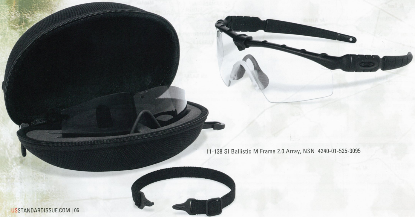
11-138 SI Ballistic M Frame 2.0 Array, NSN 4240-01-525-3095

The Oakley SI Ballistic M Frame 2.0 surpasses ANSI Z87.1 Industrial Standards for high-mass and high-velocity impact protection. Additionally the M Frame 2.0 meets MIL SPEC, MIL-PRF-31013. All lenses are made of pure Plutonite®, a proprietary material that offers the highest level of optical clarity available in eyewear. You get razor-sharp clarity at all angles of view, which maximizes peripheral vision and protection against sun, wind and side impact. It also features a clip that holds the lens and frame together providing more secure support.