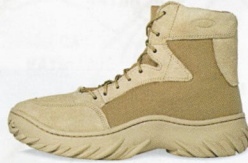
11092-889A SI Hot Weather Assault Boot 6"