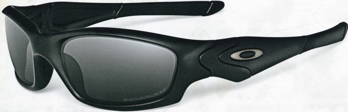
11-014 SI Straight Jacket/Black/Grey Polarized

Protection also meets ANSI Z87.1 standards for both high-velocity and high-mass impact. The durable, lightweight O MATTER® frame utilizes soft UNOBTAINIUM® components to increase grip with perspiration. It's all part of a Three-Point Fit that holds the lenses in precise optical alignment and offers all-day comfort.