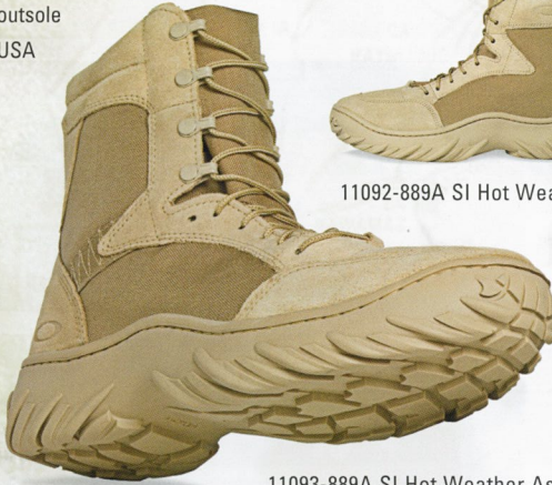
11093-889A SI Hot Weather Assault Boot 8"