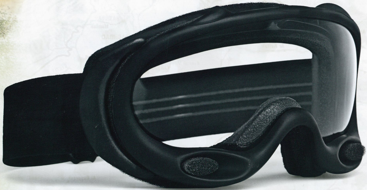
02-550 SI A-Frame Goggle/Black/Clear