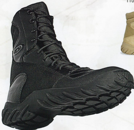
11098-001/889 SI Assault Boot 8"