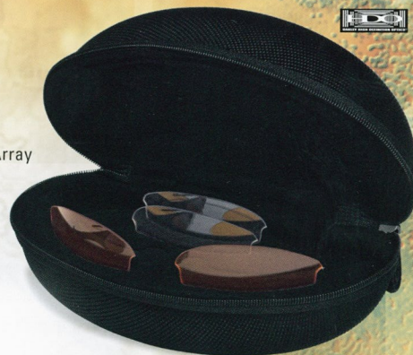
11-091 SI Half Jacket XLJ Array