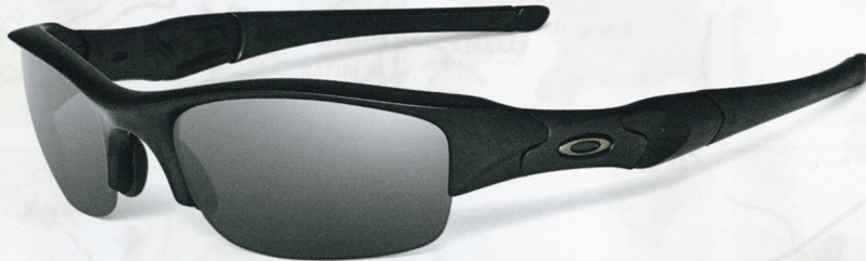
11-003 SI Flak Jacket/Black/Grey

FLAK JACKET is made of lightweight O MATTER® for all-day comfort. Pure PLUTONITE® lens material filters out 100% of all UV, and FLAK JACKET meets ANSI Z87.1 standards for impact protection. The semi-rimless design means there's no frame rim to block downward view. Optical clarity exceeds all ANSI Z87.1 standards, and HIGH DEFINITION OPTICS® (HDO®) extends razor-sharp vision all the way to the lens periphery. FLAK JACKET is available in two lens shapes: standard size and the larger XLJ. Optional lenses with Oakley HDPOLARIZED block glare while maintaining the best optical clarity on the planet.