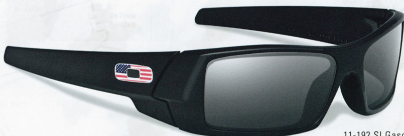
11-192 SI Gascan with U.S. Flag icon

AVAILABLE WITH OAKLEY AUTHENTIC PRESCRIPTION LENSES. USSTANDARDISSUE.COM | 19