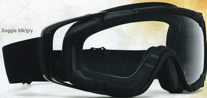
11-129 SI Ballistic Goggle blk/gry