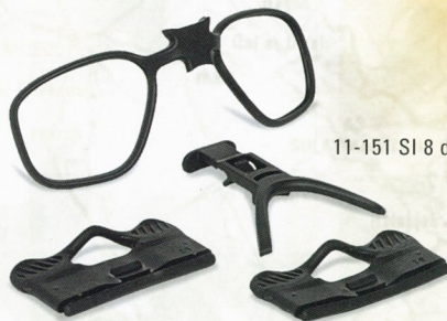
11-151 SI 8 degree RX carrier kit