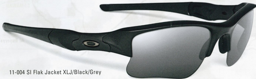
11-004 SI Flak Jacket XLJ/Black/Grey

USSTANDARDISSUE.COM | 08 AVAILABLE WITH OAKLEY AUTHENTIC PRESCRIPTION LENSES.