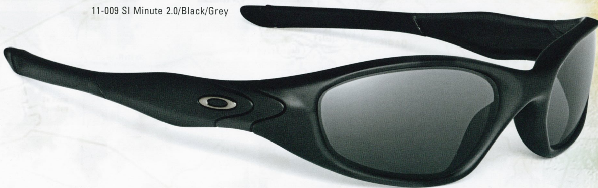
11-009 SI Minute 2.0/Black/Grey

AVAILABLE WITH OAKLEY AUTHENTIC PRESCRIPTION LENSES. USSTANDARDISSUE.COM | 13