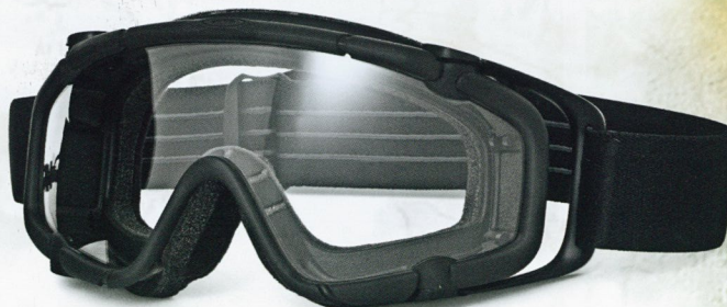
11-150 SI Ballistic Goggle Laser Array NSN# 4240-01-564-2673