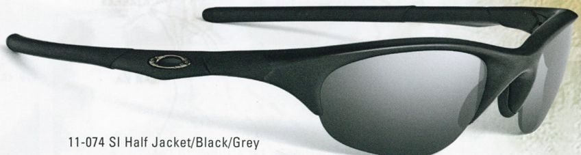
11-074 SI Half Jacket/Black/Grey

AVAILABLE WITH OAKLEY AUTHENTIC PRESCRIPTION LENSES. USSTANDARDISSUE.COM | 09