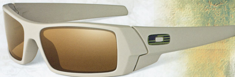
11-015 SI Gascan with U.S. Flag icon

The SI Gascan with U.S. flag Icons is an exclusive U.S. Standard Issue product that features a unique special edition Oakley American flag "O" logo. This exclusive American government inspired Gascan offers HIGH DEFINITION OPTICS® (HDO®), which combines patented optics and PLUTONITE® lens material that provides 100% UV filtering and unsurpassed impact protection. A lightweight O MATTER® frame material offers premium comfort, and peripheral vision is maximized by HIGH DEFINITION OPTICS® (HDO®), an innovation that maintains visual clarity at all angles of view. Impact protection meets ANSI Z87.1 standards, and our Three-Point Fit retains the lenses in precise optical alignment.