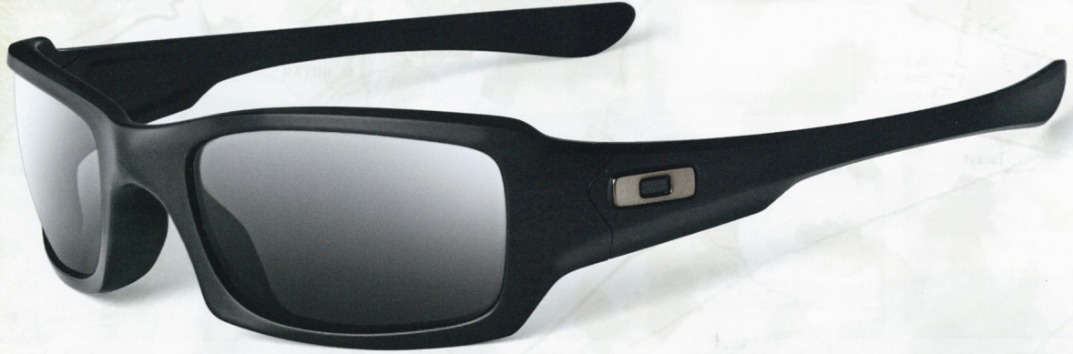
11-020 SI Fives Squared/Black/Grey Polarized

If ordinary sunglasses just don't fit, FIVES SQUARED is the answer. Unlike conventional sunglasses that stick out at the sides, this frame uses Condensed Cranial Geometry for a tapered architecture that feels as good as it looks and it's a look that soaks sophistication in adrenalin. Our Three-Point Fit maximizes comfort while holding the lenses in precise optical alignment letting the innovations of HIGH DEFINITION OPTICS® (HDO®) do their work. Optical performance and impact protection meet ANSI Z87.1 standards.